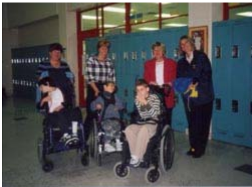
Rolling to school at Highview PS in Aurora

This was York Region's second year of participation in IWALK and a whopping 49 schools took part. The event was coordinated by York Region Health Services, with support from the York Region Planning Department and York Regional Police. The York Region Catholic and District School Boards both played an active role in promoting the event to all elementary schools. Thanks to funding from the York Region Heart Health Program, each school received a goodie bag of prizes for their