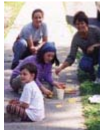
Painting footsteps at Avon PS in Stratford

Participating schools celebrated IWALK with creative activities that got everybody involved in reclaiming Ontario's community streets for walking. Greenest City provided registered schools with organizing materials, including a poster, flyers, a banner kit, stickers and the 5-Steps to Organize Walk to School Day booklet. Schools used the materials to make their own unique celebrations, based on their communities' issues and characteristics. Greenest City supported schools as they organized their events, both directly and through the GC web site, which contained lots of useful resources.